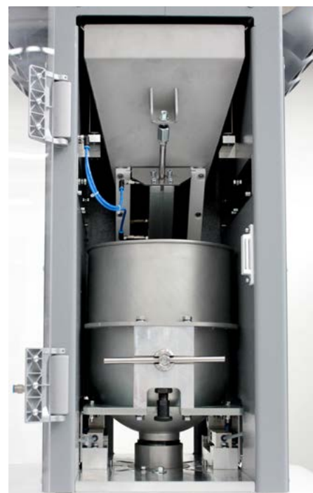
Mixer on double load cells