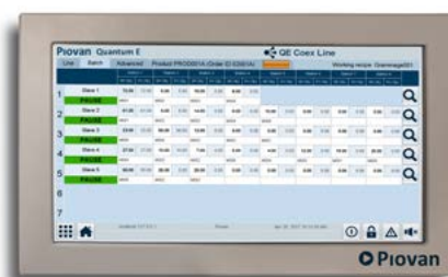
Quantum E 15" color touch screen panel

The control interface is available in 11 languages, with a color touch screen panel - 7" or 15" - and allows the management of a system from 1 to 11 layers.